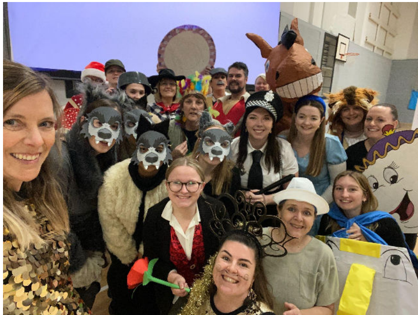
Merry Christmas from all of our Primary Staff.