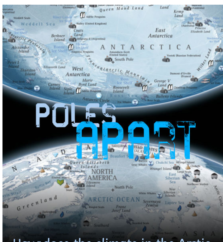
How does the climate in the Arctic and Antarctic differ to the UK?